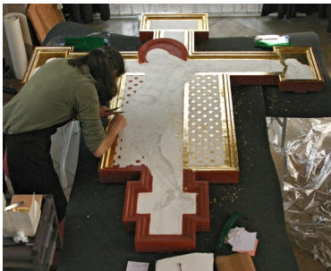
Gilding the crucifix