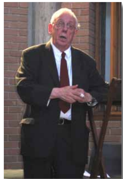
Professor Alasdair MacIntyre