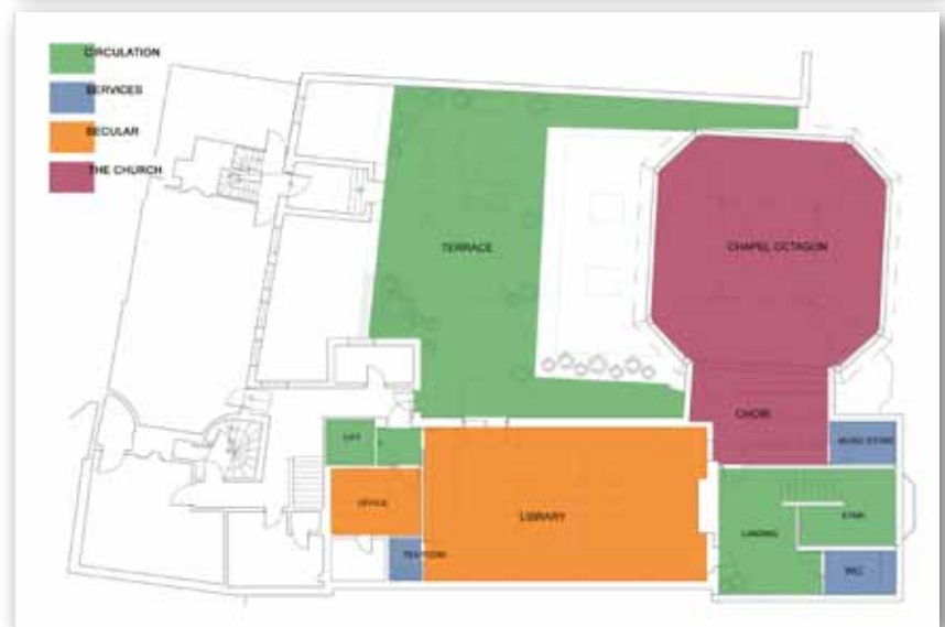
Top right: Proposed ground floor plan