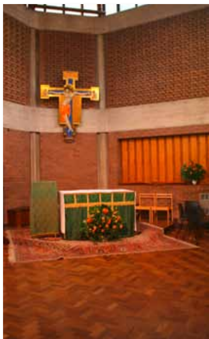
Current ordering of the sanctuary

After a competition in which six architects outlined schemes, this work has been placed in the hands of the Cambridge firm of Freeland Rees Roberts, whose sensitive conversions of existing Cambridge buildings will be familiar to many members of Fisher House. The plans include the replacement of the current tunnel-like entrance passage to Fisher House by a wider entrance-hall, opened through one of the arches of the present small chapel. A glazed portico and enlarged courtyard will provide a more spacious and welcoming approach to the new chapel, as well as space to gather before and after Mass. The altar, tabernacle and enlarged sanctuary will be re-sited at the end of the hall nearest Fisher Square, and a choir and organ loft will be opened at first floor level, releasing floor space for congregational seating.