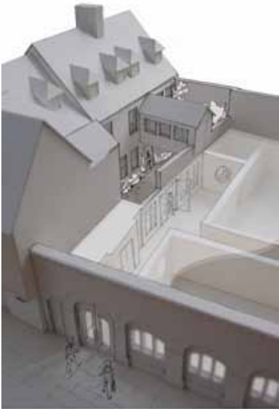
Artist's impression of the new entrance

Familiarity breeds affection. Probably relatively few members of the chaplaincy consciously notice that for the last thirty-five years, term-time Sunday Mass at Fisher House has been celebrated at a movable altar squeezed into the corner of the hall, for a congregation seated awkwardly round it on stackable chairs. And few may have noticed that, till the arrival of our glorious Cimabue crucifix two years ago, that hall lacked any permanent symbol of Catholic faith. The existence of a small and beautiful chapel for weekdays has compensated for this lack. Nevertheless, for more than a generation in Fisher House, there has been a strong element of make-do-and-mend about Sunday Mass, the most important aspect of Catholic life.